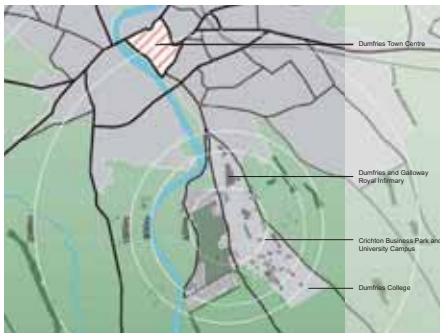
A plan of the Ladyfield site, drawn in relation to notable local landmarks, including the Dumfries town centre.

for public participation and discussion of the design process. The public and private sector teams associated with each site will act as the lead participants throughout the Charrette process, working alongside the design teams and the local community participants.