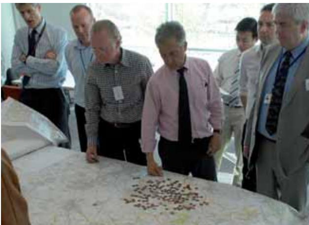
Above: Designers from Duany Plater-Zyberk and Company develop neighbourhood master plans and regional master plans at Charrettes in Hertfordshire and Inverness.