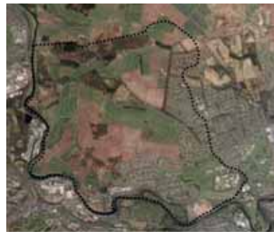
An aerial of the Grandhome site, which will be a major urban extension in Aberdeen, located between the city centre and the airport.

“The series of Charrettes offer a tremendous opportunity to demonstrate the collaborative approach that the modernised planning system in Scotland can deliver in a truly exemplary way. The process has the potential to focus professionals in the private and public sectors, as well as local communities. At a time when the economic climate presents an additional challenge, initiatives such as the charrettes series can improve quality and help to secure consensus in the planning and design process and act as a template for the successful future delivery of sustainable communities across the country.”