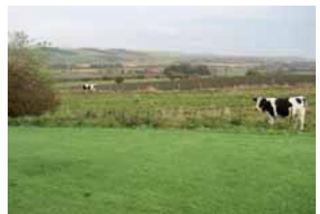
Above: Photographs of the Lochgelly Strategic Land Allocation sites. Below: Development Concept Diagram for Lochgelly Strategic Land Allocation.